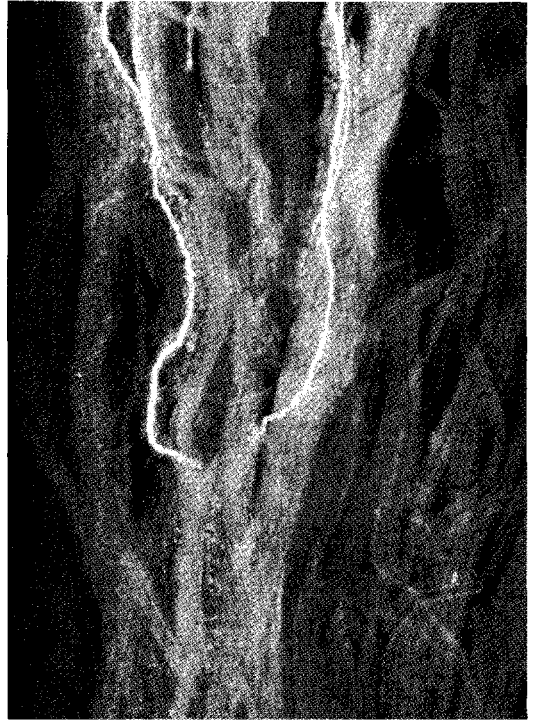
Fig. 2 The middle part of the style of clone no. 9246 after selfing. Incompatibility reaction inhibits further growth of the pollen tubes.