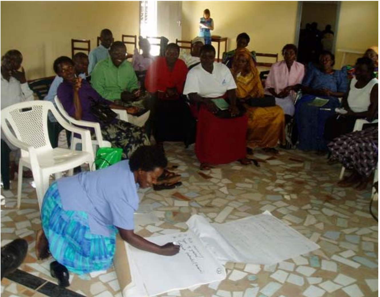
Figure 2. Evaluation workshops were held in the farmer groups at the end of the project, where farmers discussed the outcomes and process of participating in the farmer groups.

Participatory Impact Assessment workshops and evaluation workshops. Two PIA workshops were conducted by two experienced facilitators, following the method described by Oruko et al. (2003). One was held in Jinja municipality combining the urban and peri-urban farmers from the project, and the other one in Butagaya with the rural farmers. The Participatory Impact Assessment (P.I.A.) is a widely used method of assessing impact among a group of participants in client-oriented research and dissemination projects (Jackson & Kassam, 1998). The P.I.A. process is directed towards ranging the major impacts on household and community level as perceived by the participants, and identifying potential risks and relevant action to the achieved impact.