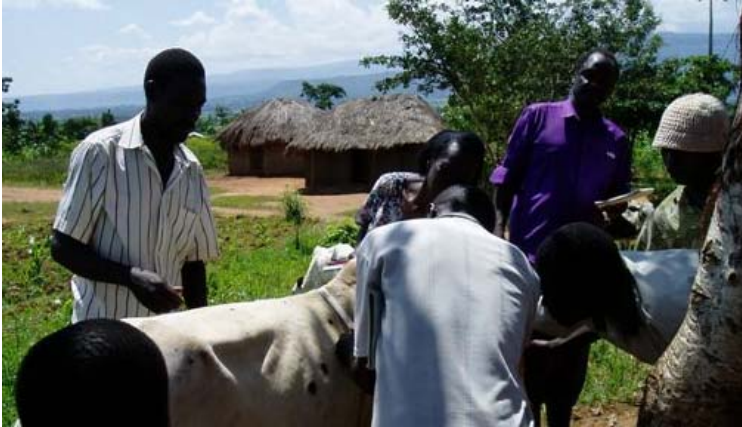
Figure 5a. Farmers estimating the weight of the cow by measuring it (heart girth).