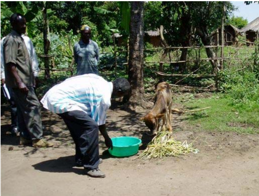
Figure 3. The farmer fed the calf after advice from the group. In this way, it was clearly visible to everybody that the calf was hungry instead of in need of medicine.

It was hot, even though we met at around 10 o'clock in the morning. The farmer group members greeted each other and sat down in a circle in the shade under a tree talking for about 30 minutes about this farm, including the daily practices. After this, the group examined the two cows, which were tethered left standing under the burning sun. When the facilitator attempted to close the meeting, the farmer asked for a bit more time, because he had a calf he wished to show the group. We had so far only focused on the cows. He thought that the calf was ill and needed medicine. He brought the calf forward. The calf was grinding its teeth and looked very depressed. The bones were clearly visible under the very dry skin, and there were clear signs of dehydration. The group concluded that it was very skinny, but nobody could really tell what was wrong. Until now, the calf had never been offered water or any other feed than milk from the mother (assumed very sparse) and what it could find itself. The facilitator emphasised the fact of even a young animal's need for supplement both in terms of feed and water and encouraged the group participants to look around on the farm for appropriate supplement feed for calves, and advised the farmer to feed his calf left over beans and water right away.