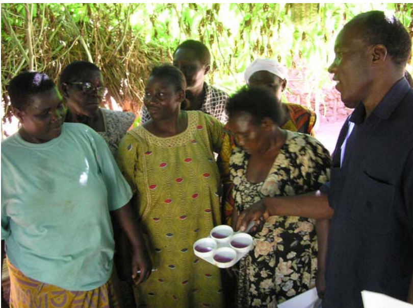
Figure 9. Technical knowledge about mastitis was taught and demonstrated to the farmers. This improved their understanding on disease occurrence and consequently also how to maintain a cow in good health. According to the farmers, the collaboration with the local extension agents had improved during the project period, and in the Ugandan context, the facilitators clearly was a great source of knowledge and teaching.

The Ugandan farmers emphasized at the evaluation workshops that a better and closer relationship with their veterinarians (who were also the FFS facilitators) was one of the major benefits of the project. So, new communicative practices were developed as a result of the empowerment process,