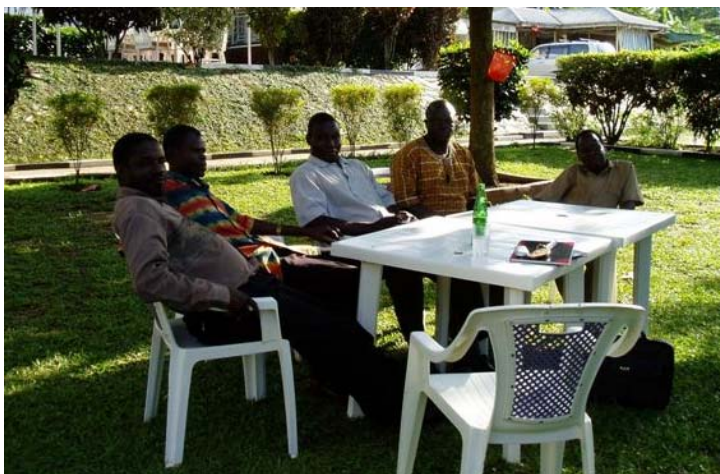
Figure 1. Five facilitators in the hotel garden where one of the focus group interviews took place.

Another method used was the focus group interview. These focus group interviews comprise interview methodologies where groups of people are interviewed (Lewis, 2000). In group interviews, common reflection, exchange of experience and elaborating interpretations or future perspectives are allowed. Such interviews were carried out in the four Danish Stable Schools and in two groups of facilitators in Mbale and Sironko, at a time where all facilitators had been facilitating at least 10 farmer group meetings. Each of these Ugandan focus group interview took approx. two hours and consisted of the facilitators' stories about their experiences in the farmer groups, common reflections on the process within the farmer groups, their own experience as facilitators, their perception of main issues in the improvement of livestock health and production in the area, their needs in terms of education and knowledge about facilitation and their point of views on relevant changes when introducing farmer groups.