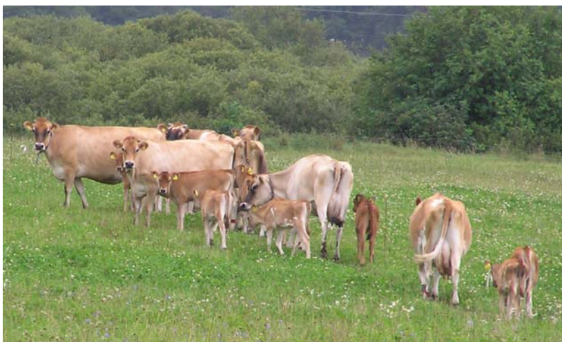
Figure 5. The farmer groups worked with many un-traditional systems and ideas, such as the so-called 'suckler aunt systems', outdoor access during winter, and lot of small innovative improvements that the fellow farmers never would have been advised to do by 'traditional advisors'.

Said by a Stable School participant, summer 2005, Focus Group interview.