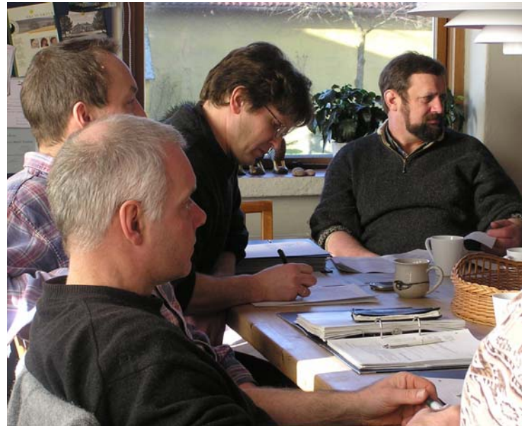
Figure 2 a & b. After having seen all outdoor facilities and all groups of animals, the group goes indoors and after a cup of coffee and ‘free talk’ they start working by going systematically through the agenda.