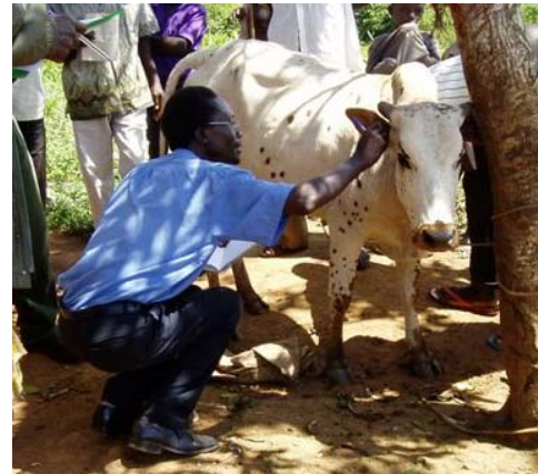
Figure 5b. Farmers counting the number of ticks on the front part and ears of the cow.