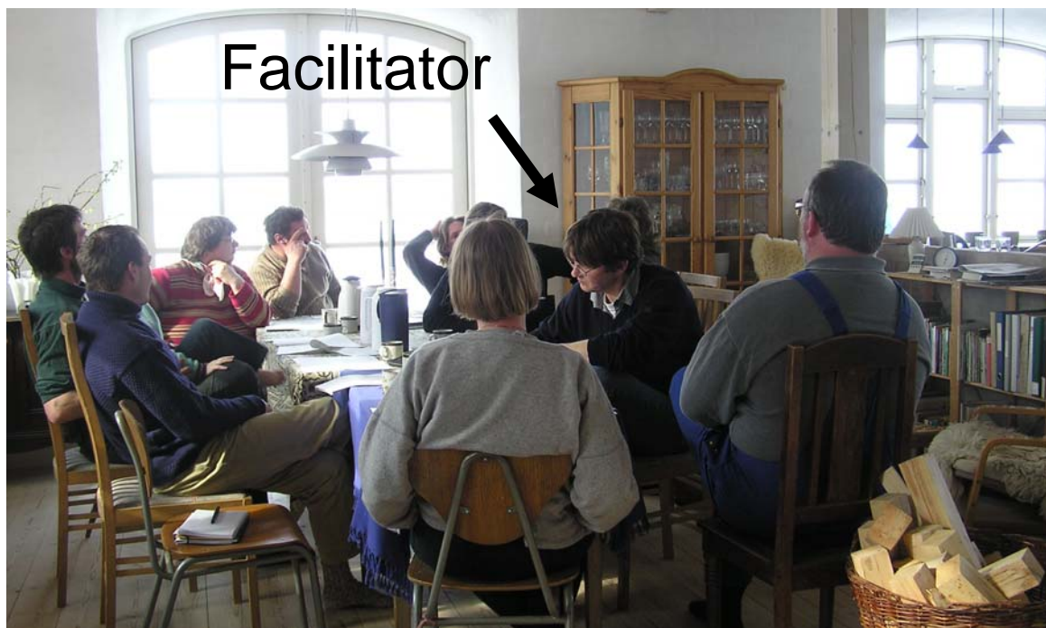
Figure 3. During the meetings, the facilitator is the person keeping the structure of the meetings, keeping track of time, keeping the group to the agenda, and writing the minutes from the meeting, which will be sent out together with the agenda to the following meeting.